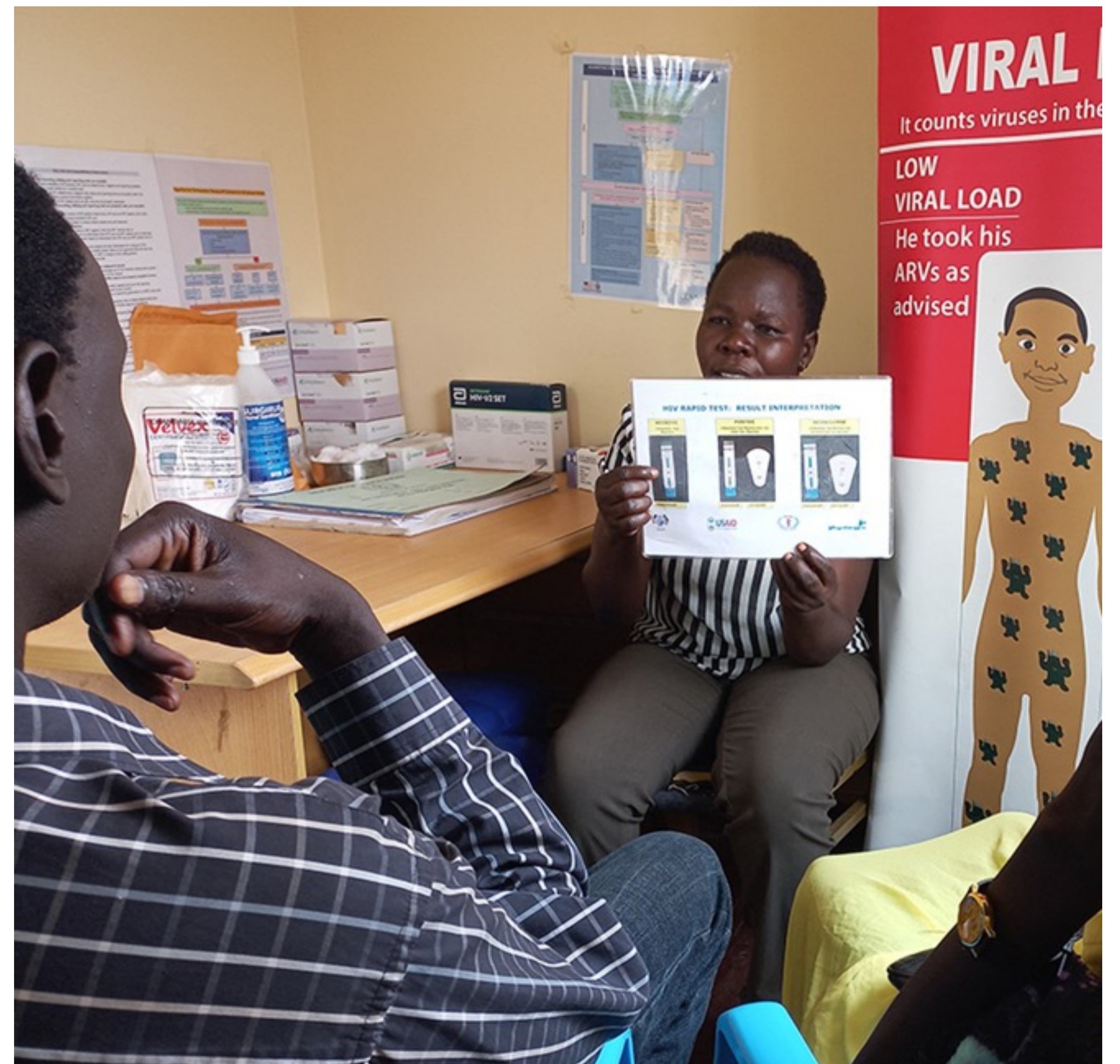
An ART clinician at Munuki Primary Health Care Center. Photo by Gladys Achan for IntraHealth International, 2023.

Structured communication, delivered through multi-media like interpersonal or group-level, can facilitate development of PrEP awareness and demand creation for marginalized populations by influencing policy, community attitude changes and raising awareness on the impacts stigma, discrimination to break barriers to HIV service-access, increase service availability awareness, benefits, and relieves clients' fear and anxiety.